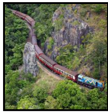
Tuesday, November 13th, 2012 (B, L)