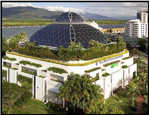
Monday, November 12th, 2012 (B,L)